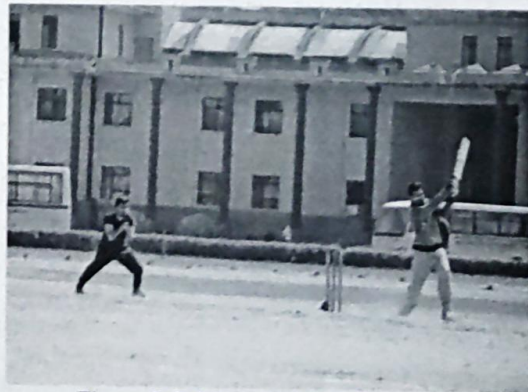
Figure 2 Cricket, 22/2/2020