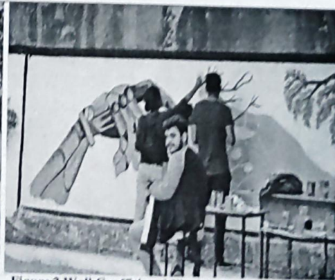
Figure 2 Wall Graffiti and Floor Painting, 19/2/2020