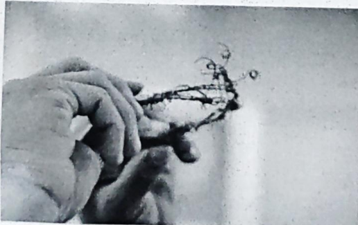
Figure 1 Jewellery Design, 20/2/2020