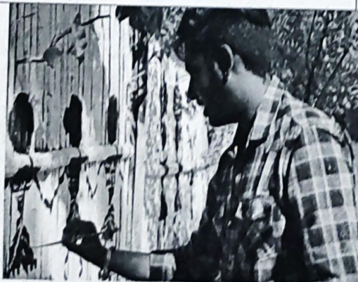
Figure 1 Wall Graffiti and Floor Painting, 19/2/2020