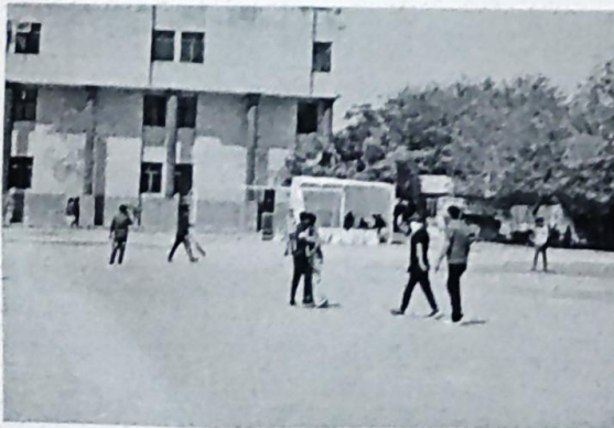
Figure 1 Cricket, 22/2/2020