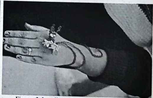
Figure 2 Jewellery Design, 20/2/2020